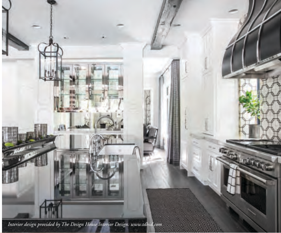
Interior design provided by The Design House Interior Design. www.tdhid.com